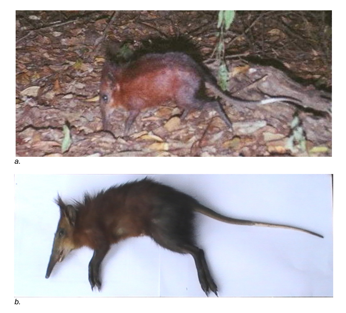
Figure 2. a) Camera-trap image of Rhynchocyon sp. from near Basuba (figure 1) on 29 September 2008. b) Specimen of Rhynchocyon sp. captured on 21 September 2008 at Mangai, Kenya.

colouration patterns for taxonomic purposes among the remaining forms of giant sengis, however, are more complicated and thus not as readily resolved.